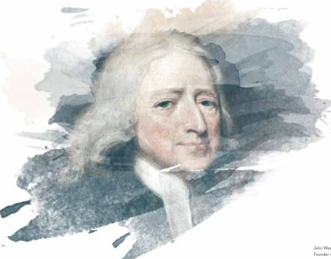
John Wesley, 1703-1791 Founder of Methodist Movement